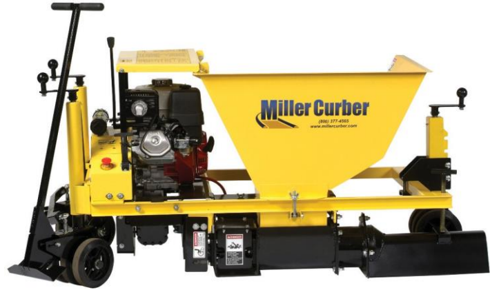
MC550/650 with Wheelbarrow Hopper

For over fifty years the Miller MC Series Curbuilders have offered unequalled performance and versatility for the placement of free-standing curb. These simple and efficient self-propelled machines operate on the extrusion principle and provide the most economical means available of constructing small to mid-sized continuous curb from either concrete or asphalt. This quick and efficient process drastically reduces the high labor costs associated with hand formed and poured curb and produces high quality, extremely dense curb at a rate of up to 15 fpm (up to 30 fpm for MC900). Miller's interchangeable extrusion auger assemblies give each Curbuilder the capacity to extrude more shapes and sizes than any machine in its class, from 4" to 18" high curb. A wide variety of options allow these machines to meet the toughest specification work.