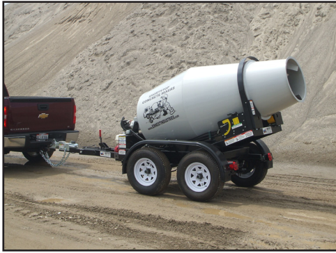
Tow To Your Jobsite