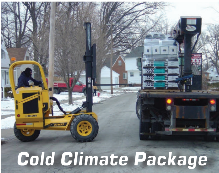
Cold Climate Package