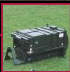
Hook up and go, works with any hook lift.