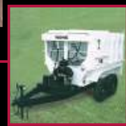
Pull it or park it, the trailer mount is always ready to work for you.