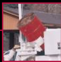
Add a barrel dumper or a cart dumper to either side.