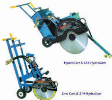
HydraCart &amp; S24 HydraSaw