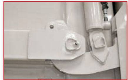
Automatic cam-over-latch tailgate locking mechanism activated from cab