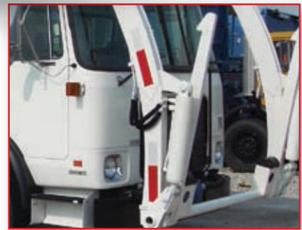
Front forks load rated for 8,000 lbs.