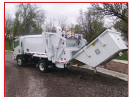
Handles commercial containers up to 6 cu. yds.

WAYNE® ENGINEERED FOR PERFORMANCE www.WayneUSA.com