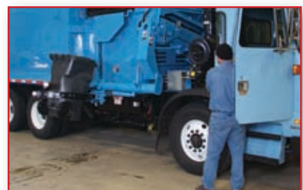
Optional under-seat control for operating from the ground