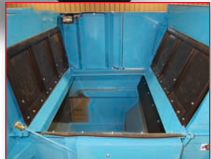
Rugged plastic hopper covers