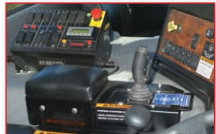
PLC logic controller with performance data capture and service minders