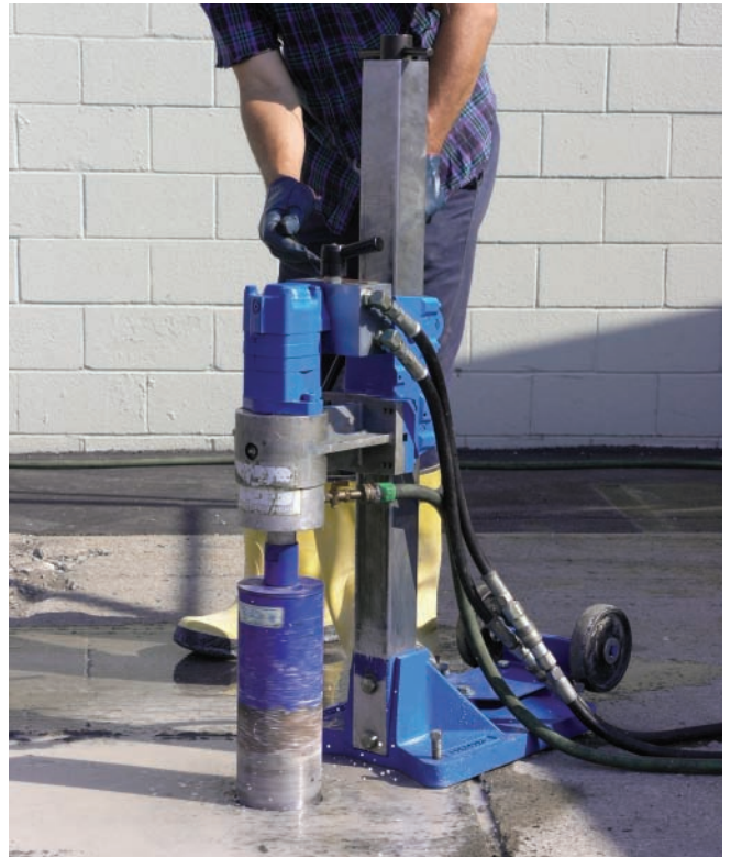
CD616 HydraCore Drill cutting a concrete floor

* Unit will accept up to 27 in. tall core bits. Taller masts are available to fit longer core bits.