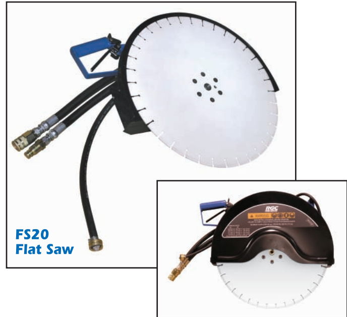
FS20 Flat Saw

Safely cut a variety of materials in confined spaces, damp environments and even underwater without risk of fumes or electrocution. Operate the FS20 Flat Saw from an RGC HydraPak or another compatible auxiliary power source with the addition of a Flow Divider.